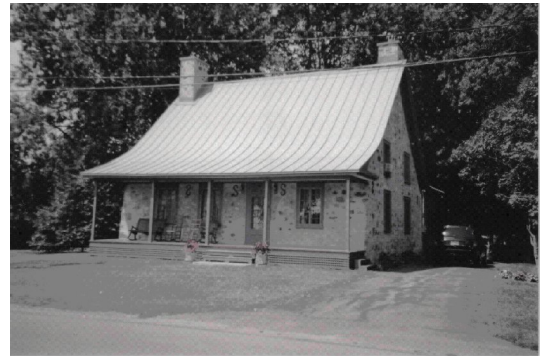
Duhamel house (1798-1799)

the Gour-Mongeau house, at 702 Notre-Dame street, built about 1820, with a mansard roof.