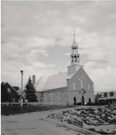
Saint-Sulpice church (1832)

A first chapel was erected in 1706 and replaced by a church of stone whose work began in 1724 and was completed the following year. However, the decoration would not be completed until many years later. At the start of the 19 th cent, a serious construction problem manifests itself : the bell tower is in danger of collapsing. Already, in early 1802, the representative of the bishop of Québec writes the parishioners : « having examined, during our visit to said parish, the jube and the benches of the jube (... ) we have judged it necessary to deny access to it » 6 . Attempts to repair it were made, but it was evident that this church no longer met the needs of the parish. Finally, in 1832, the current church was constructed, based on the plans of Victor Bourgeau. On May 23, 1832, abbé Antoine Tabeau, Vicar-General of the diocese of Québec blessed the new church.