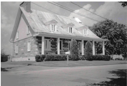
Perreault-Lamontagne house (1819)

The towns of L'Assomption, L'Épiphanie, including the parish, the municipalities of Saint-Jacques, Sainte-Marie-Salomée, Saint-Alexis and Saint-Liguori were all detached, in whole or in part, from the seigneurie of Saint-Sulpice.