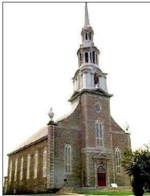
The fire on December 22, 2000

Source: Deshaies, Marcel, c.s.v., Bécancour : ma paroisse : terre bénie de mon enfance et amour sacré de ma patrie , 1977